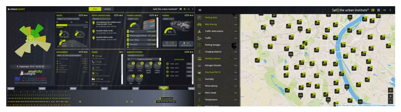
Figure 2: Urban COCKPIT. Tile View on the Left, Map View on the Right