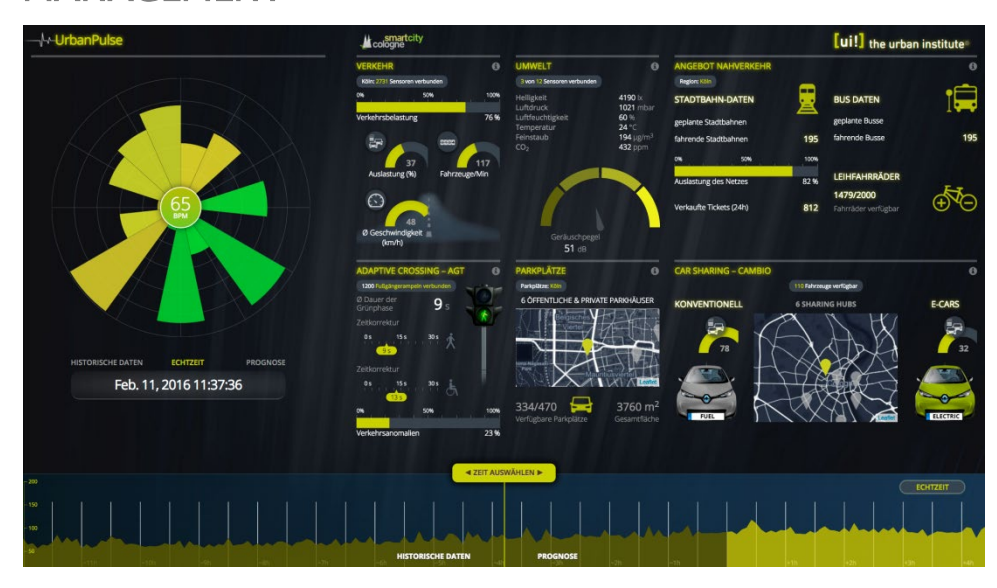
Figure 1: The Urban COCKPIT