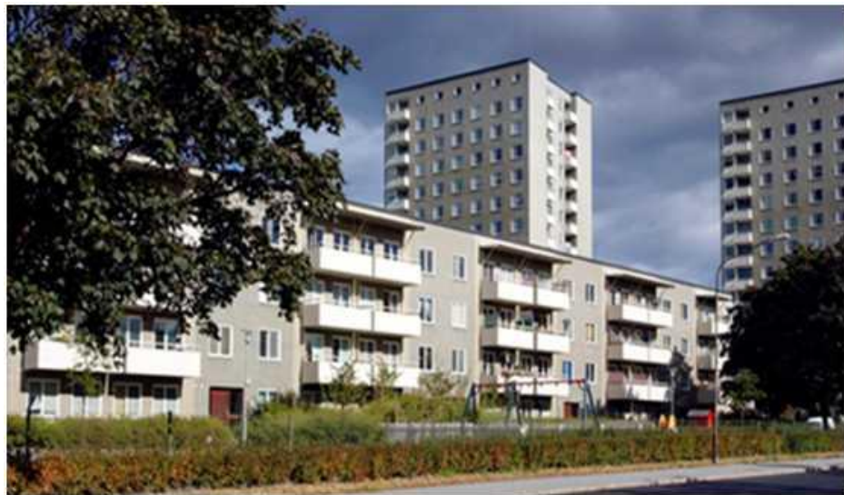
Fig 1: Refurbishment, Valla Torg, Stockholm