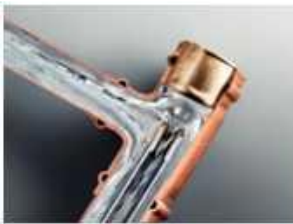
Fig 3: "Pipe in pipe" system

Instead of installing a traditional system with a circulation pipe parallel to the water pipe, the project will use a solution where the two are installed one inside the other, to minimize the surface where heat may escape and keep the water temperature high.